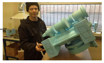
Stage 3: Assemble and wax component for improved surface finish.