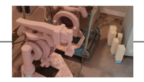
Stage 5: Dry pattern between coats.