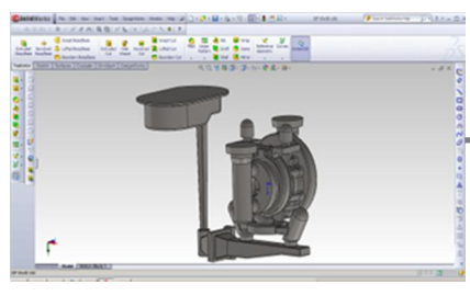
Stage 1: 3D CAD Design, Casting methoding and CAM