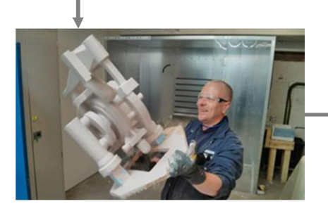
Stage 4: Coat polystyrene pattern with ceramic slurry and backup